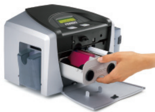
DTC400e single-sided printer

Designed for easy operation and hassle-free maintenance. The Fargo DTC400e features an all-in-one ribbon cartridge that combines a printer ribbon and card cleaning roller into one convenient unit. Just slide in the cartridge, close the door, and you're done. No feeding or tearing ribbon rolls, no fumbling with separate cleaning rollers. The integrated cartridge ensures that you'll change the cleaning roller with every ribbon change — a critical step to ensuring high-quality printing of conventional and rewritable cards.